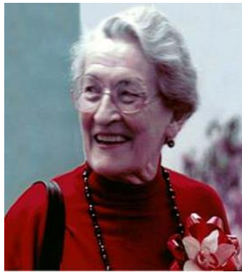
Mary Ainsworth (1913 – 1999)