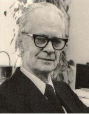
B. F. Skinner (1904 – 1990)