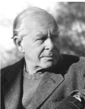
John Bowlby (1907 – 1999)