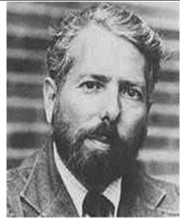
Stanley Milgram (1933 – 1984)