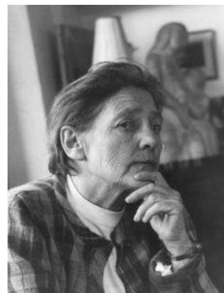
Marie Jahoda (1907 – 2001)