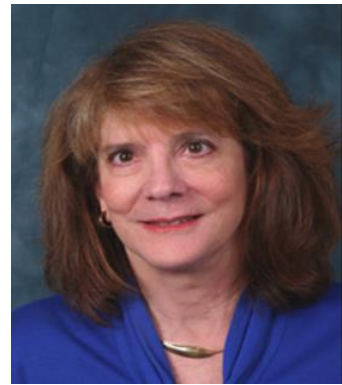
Elizabeth Loftus (1944 - )