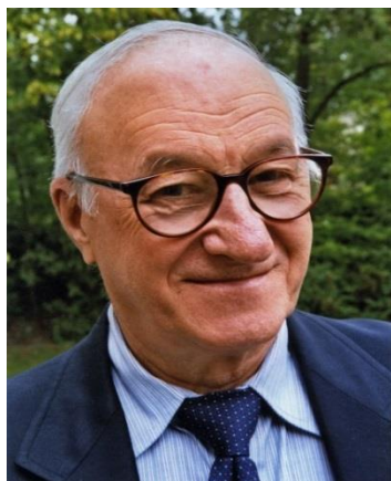
Albert Bandura (1925 - )